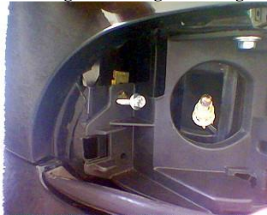
Bolt to remove to remove the clip.