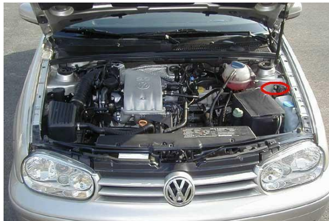
mounting stud circled in red